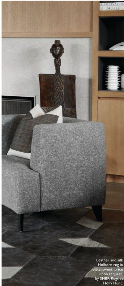
Leather and silk Holborn rug in Bittersweet, price upon request, by SHIR. Rugs at Holly Hunt.

Lowe , with sales of $48 million, according to Chicago Agent Magazine . Compass Real Estate , lowegroupchicago.com